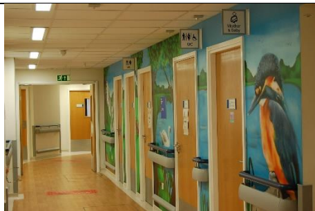
The Visitor toilet, Disabled toilet, and the Mother and Baby feeding/ changing facilities are down this corridor.