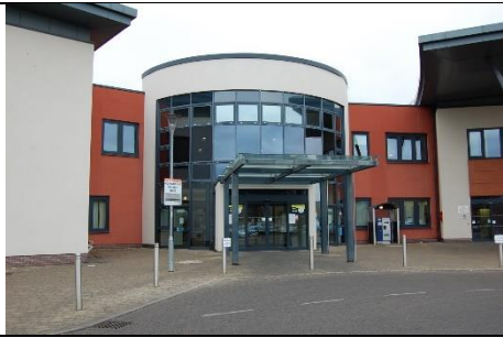
The Child Development Centre is located within the City Care Centre.