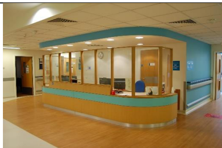
You will then find our main reception team, who will be able to assist you with your appointment.