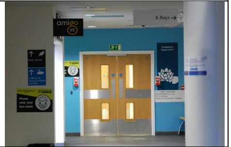
Make your way through the building and the Child Development Centre is just beyond the shop.