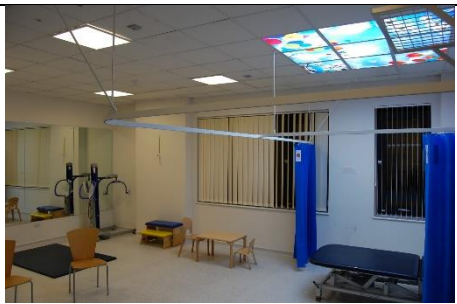
The Therapy Gym is one of our appointment rooms.