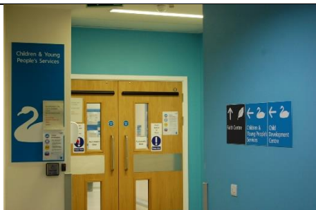
As you turn the corner, you will find the Child Development Centre main doors.