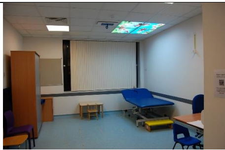
The Large Therapy Room is another room we use for appointments.