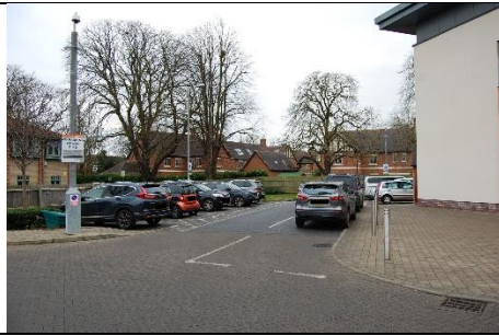
There are allocated spaces for Disabled badge holders, as well as paid parking for all other visitors and staff.