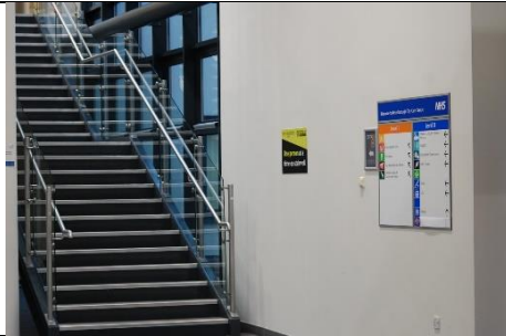
As you enter through the main automatic doors of the City Care Centre, you will see signs directing you to the Children & Young People's Services, where the Child Development Centre is located, follow the white Swan.