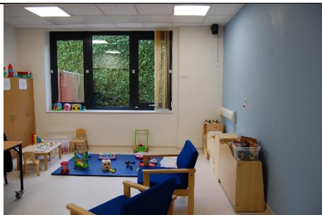
This is the Multi-Disciplinary Team (MDT) assessment room.